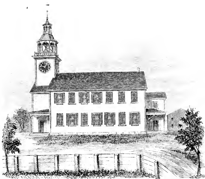
MEETING-HOUSE ERECTED 1788.